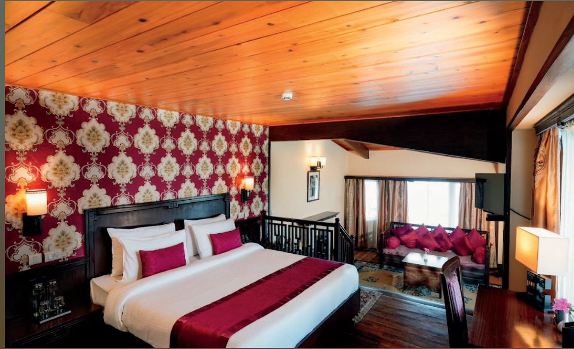
HERITAGE SUPERIOR DELUXE ROOM