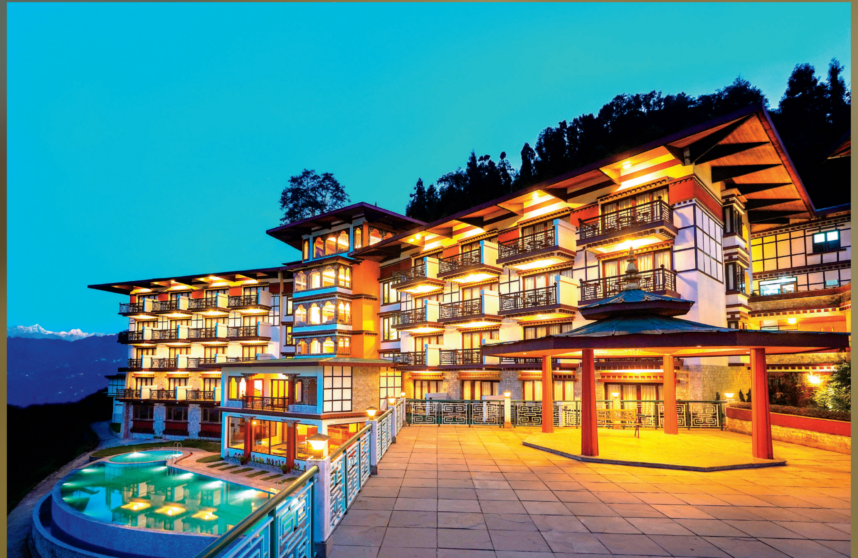
Denzong Regency, Cherry Banks, Gangtok-737101, Sikkim