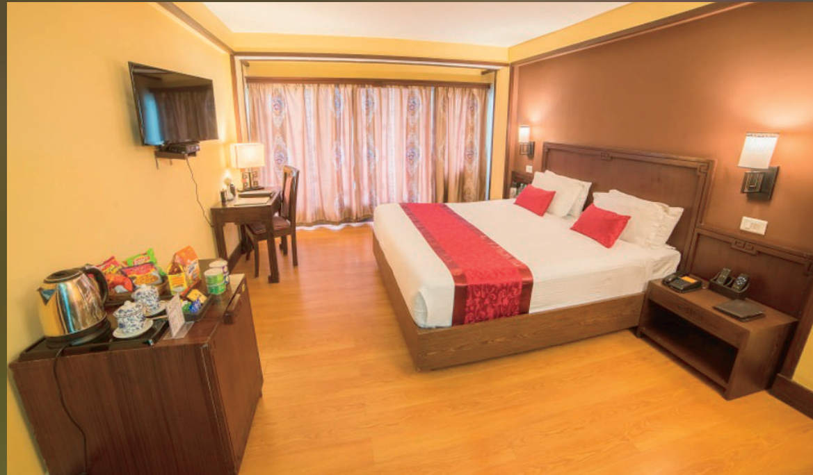
HERITAGE DELUXE ROOM