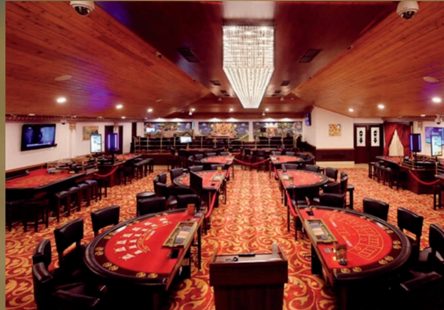
DELTIN CASINO 24 HOURS IN-HOUSE

Denzong Regency, Cherry Banks, Gangtok-737101, Sikkim